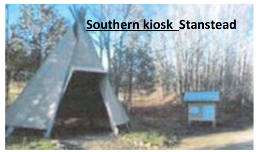
Southern kiosk Stanstead