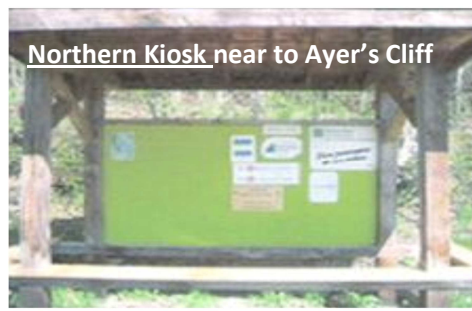
Northern Kiosk near to Ayer's Cliff